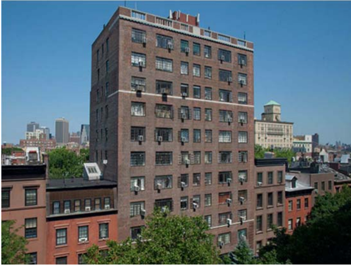
25 Monroe Place